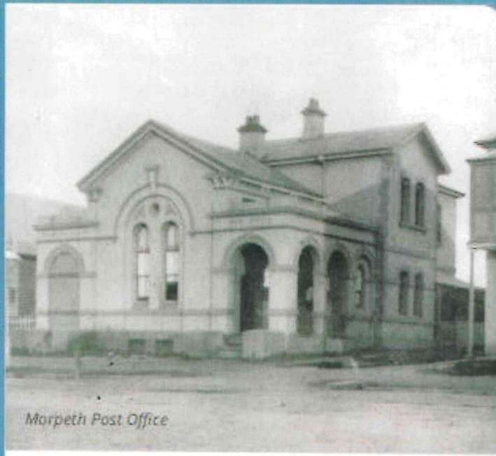
Morpeth Post Office

Visit mymaitland.com.au to learn more about Morpeth and plan your visit.