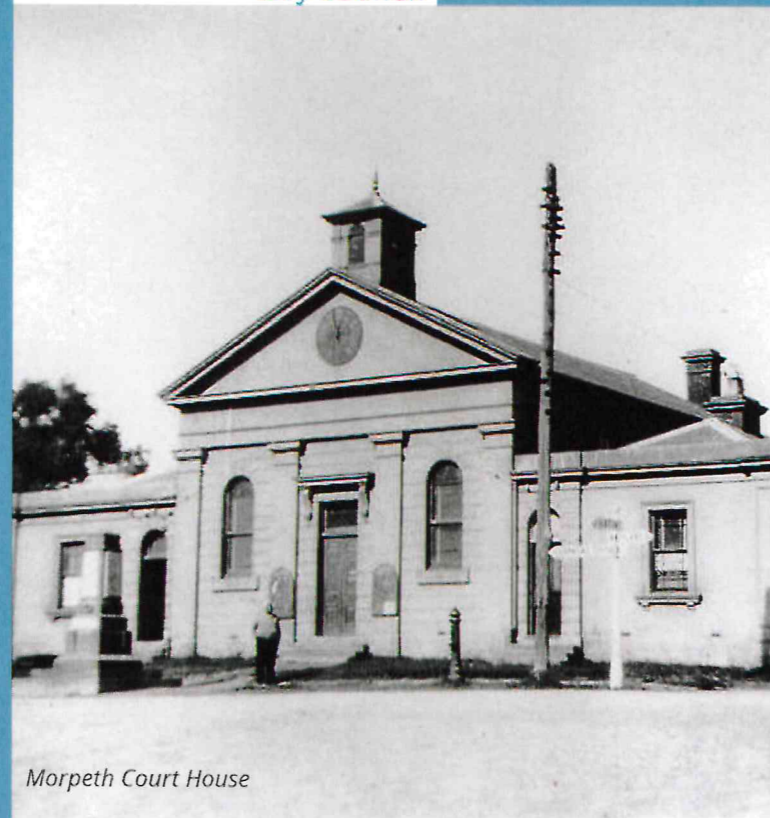
Morpeth Court House